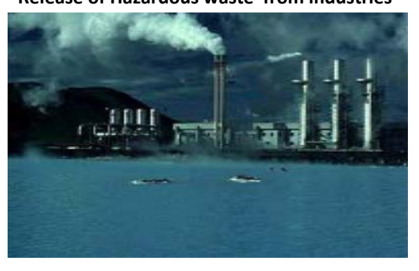
Release of Hazardous waste from industries

The lack of a preventative approach to waste management has led to generation of more and more hazardous wastes and sadly, controlling hazardous waste has become a serious problem in India and no special care is taken in their management. Implementation of the ban on the ground is very negligent and hazardous waste is coming to our shores in regular phenomenon. Apart-from generating their own hazardous wastes, India invites import to such waste in the name of reuse and recycling, though there is lack of environmental friendly technology to reuse and recycle hazardous waste.