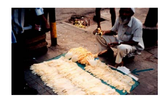
Amalgams -poison in the making

Unmediated and unhealed syringe in the municipal dump may come back in the hospitals and may then be used on a patient, who may get cross-infected.